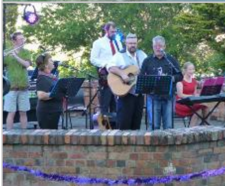
Carols in the Park